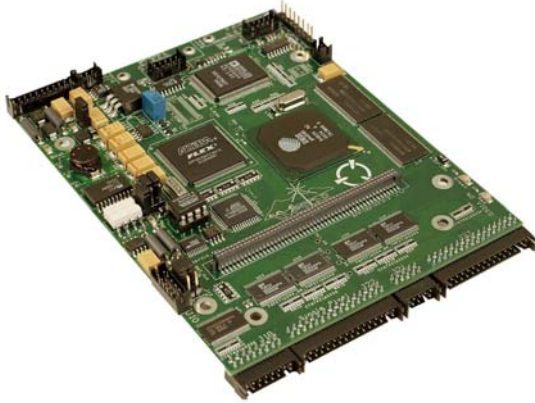
VP5 Video Processor

The VP5 module provides direct connection from analog video sources to a wide range of commercial digital AMLCD display modules.