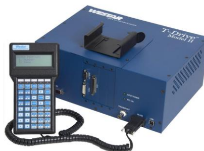
Westar T-Drive II